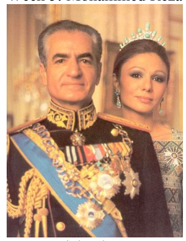
Sick, chapt. 1

Week 5: Mohammed Reza Pahlavi: Here Comes the Shah: 1953