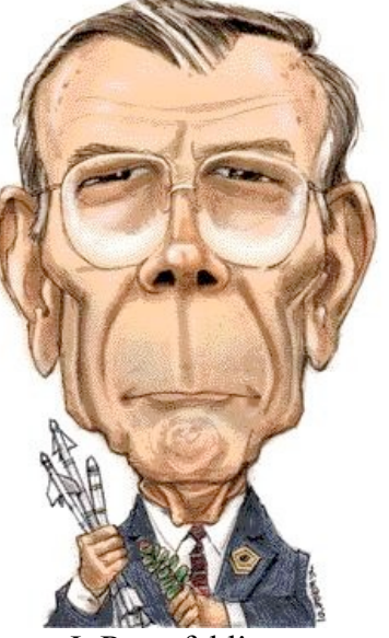
"Whose your Baghdaddy?"